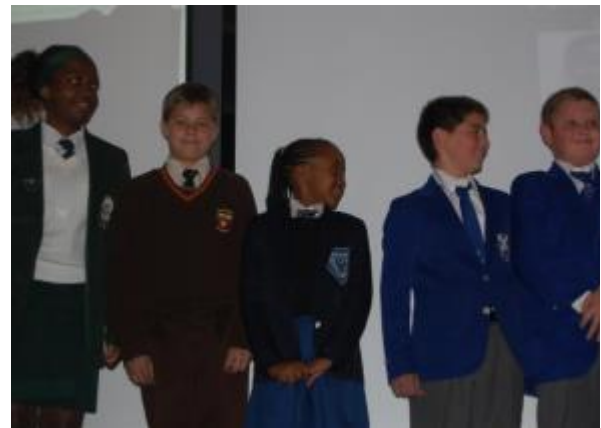
A Tribute to Mandela from the children of Bloemfontein