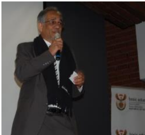
The Deputy Minister of Education, Rt Hon. Enver Surty