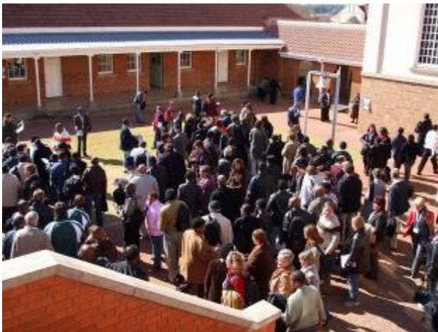
Collecting venue tickets

Other teachers (who have not yet completed the Intel course) were so motivated by seeing their colleagues being recognized in this way that they were eager to find out how they too could receive Intel training.