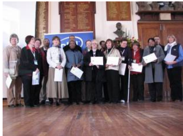
Intel Teach Silver and Gold certificate holders

In addition to teachers, the Intel ICT in the Classroom conference attracted a number of provincial and national education department officials. Their attendance at the conference helped reaffirm their belief in the value of integrating technology into the classroom and exposed them to a range of strategies for doing this effectively. To provide an opportunity for education department officials to share insights and experiences of incorporating ICT integration training in their provinces they were all invited to an informal meeting where they got to share their experiences and ask questions of Intel and SchoolNet representatives.