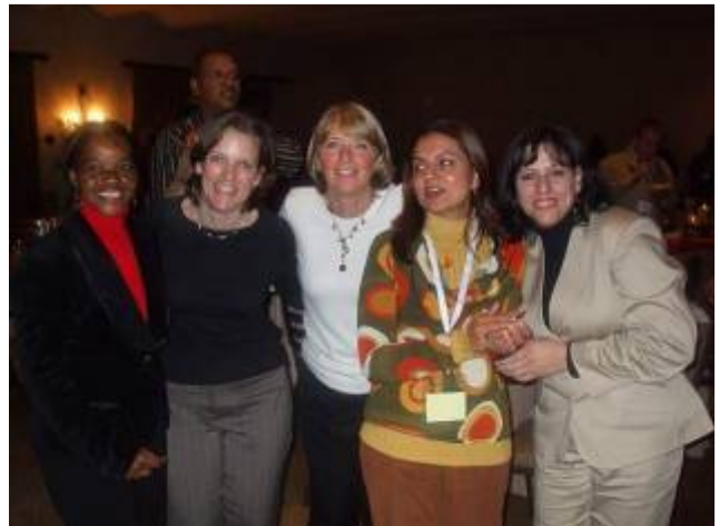
The SchoolNet staff at the Gala Dinner