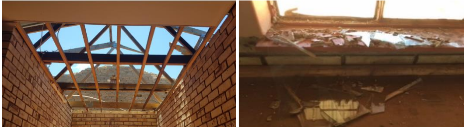
Figure 1: December 2016 School Visit

The identified activities were completed with learner, teacher and parent assistance and we are proud to confirm that the following activities have been completed: