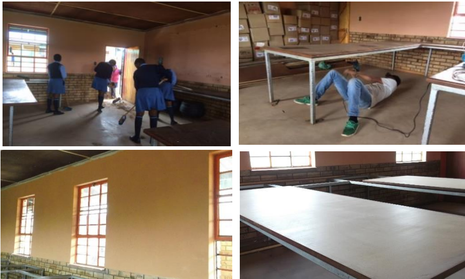
Figure 2: February 2017 School Clean up

The work at Bethania Secondary School is a humbling experience as school on top of the mountain had clearly slipped off the radar. With minimal assistance the school is now working toward instilling pride and ownership from its learner and parent body. Stay tuned for more progress as we extend our support throughout 2017.